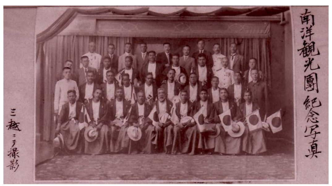
Figure 1. Group Photo of the Participants of the First Cultural Tour, Mitsukoshi Department Store

The land register record compiled in the 1930s shows that the relocation of the village did happen in Ngiwal, as remembered by villagers. There were four hamlets in Ngiwal at the beginning of the 20th century. A German ethnography shows that house lots were scattered around old stone paths leading from seashore to inland before the Japanese era (Krämer 2002: 119) (see Figure 2). However, in the 1930s, 39 out of 49 house lots in Ngiwal were arranged along the Ginza Road (see Figure 3) (DLM 1967; 1970a; 1970b). It is certain that the relocation did happen, at some point prior to the 1930s.