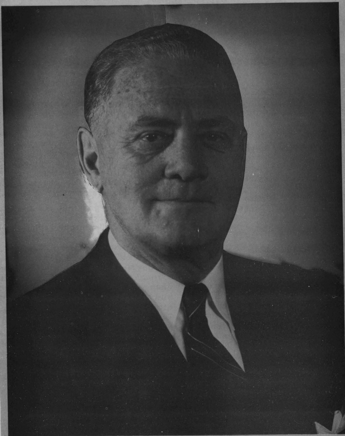
FRANK E. MIDKIFF

High Commissioner of the Trust Territory of the Pacific Islands