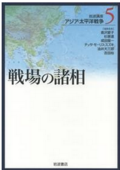
The edited volume containing Yoshida's article, published by Iwanami Shoten

Ajia-Taiheiyō sensō 5: senjō no shosō (2006)