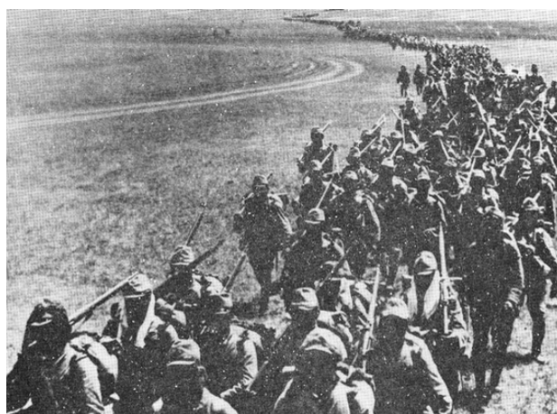
Japanese soldiers on the march, 1939.

on foot, and the primary mode of transportation for artillerymen and machine gun squadrons within infantry regiments was not car but horse. Even the transport corps, which was tasked with supplying food and ammunition, depended largely on transportation by horseback and horse-drawn carriage. When it came to movement and transport, the Japanese Army relied heavily on its foot soldiers and horses.