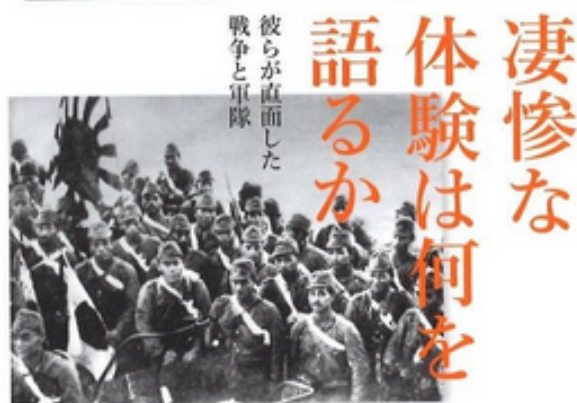
中公新書 2465 定価 本体820円(税別)