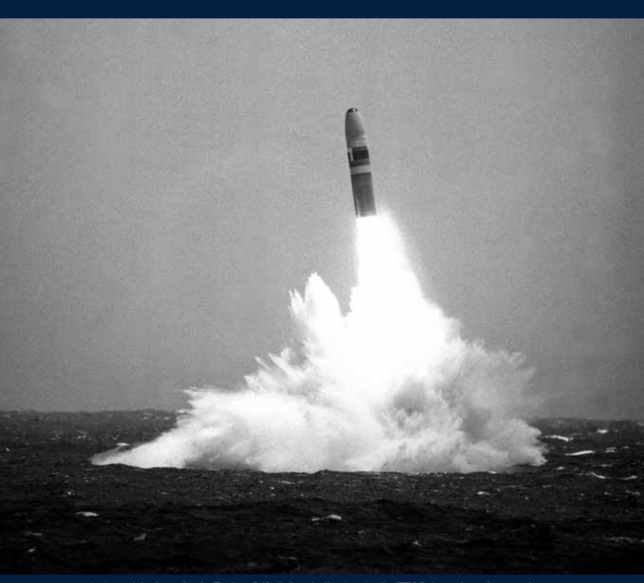
A view of the launch of a Trident I (C-4) fleet ballistic missile (FBM) from the submerged nuclear-powered strategic ballistic missile submarine USS FRANCIS SCOTT KEY (SSBN-657).