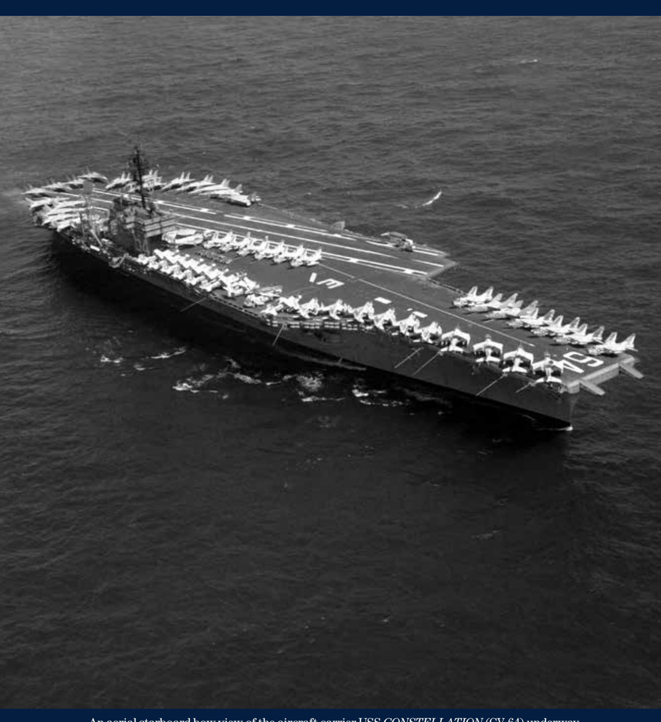
An aerial starboard bow view of the aircraft carrier USS CONSTELLATION (CV-64) underway.