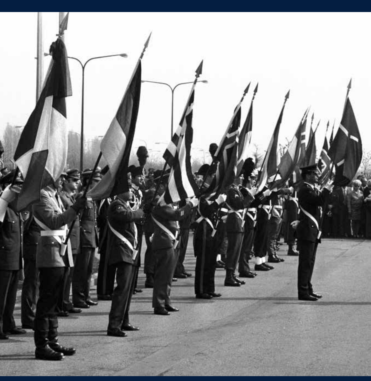
NATO celebrates its 25^{\rm th} anniversary on 4 April 1974.