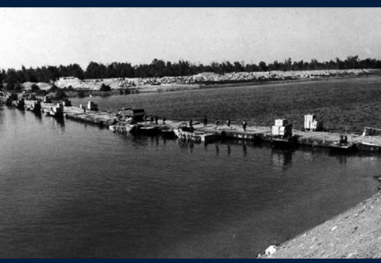
An Israeli pontoon bridge across the Suez Canal during the October 1973 War. The three bridges built by the Egyptians for the invasion were blown up by the Israelis, thus cutting off the Egyptian retreat line.