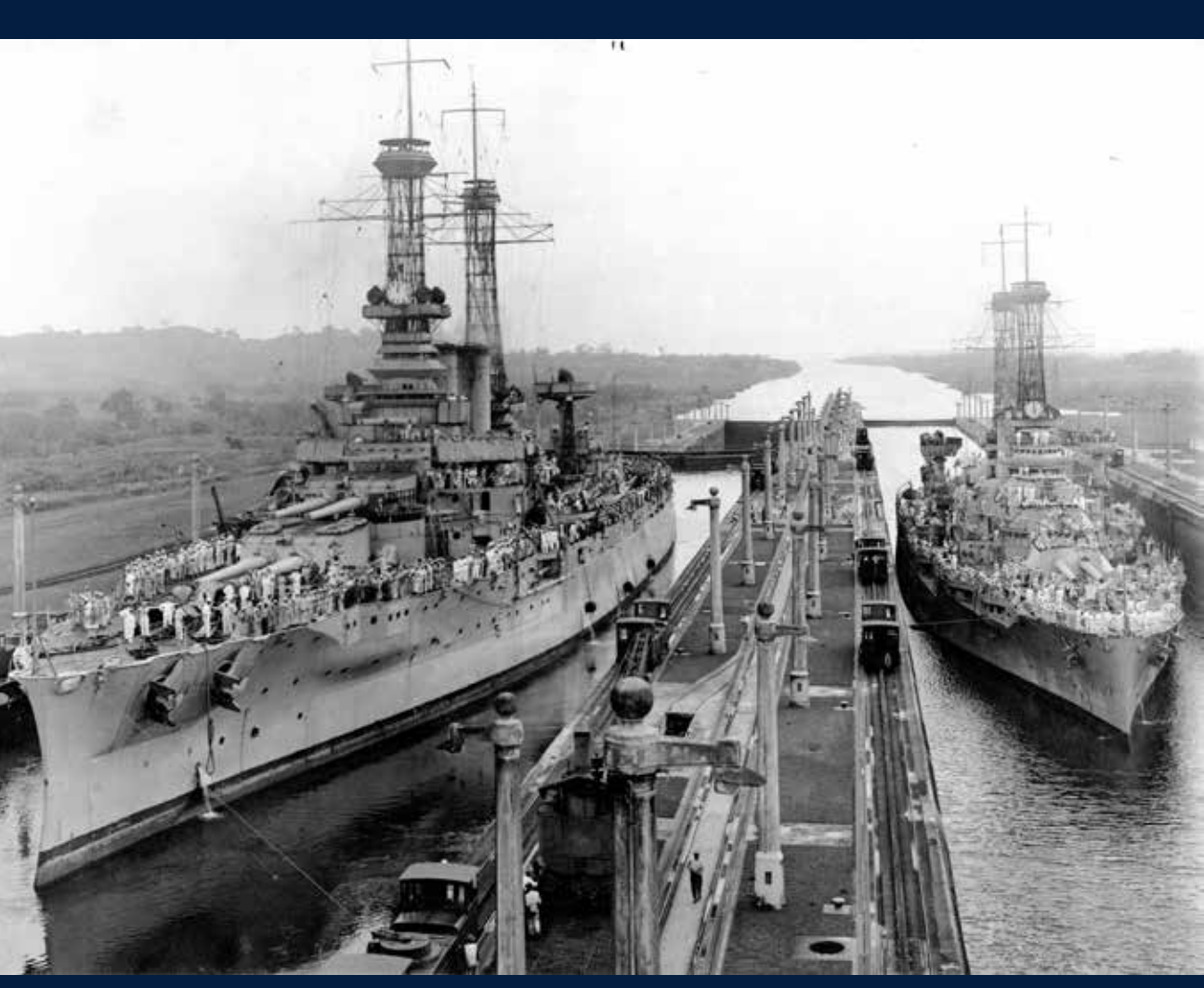
{\it USS}\, ARKANSAS\, {\it and}\, {\it USS}\, TEXAS\, {\it transiting}\, {\it the}\, {\it Panama}\, {\it Canal.}\, ({\it US}\, {\it Navy}\, {\it Photograph})